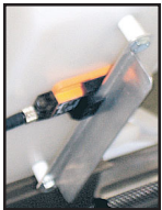
Switch & Bracket