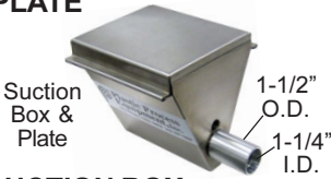
Suction Box & Plate

Stainless Steel Suction Box conveys material out of Material Storage Bins. Requires cutting or drilling by customer. Part No. 200206 ..... $275.00 ea.